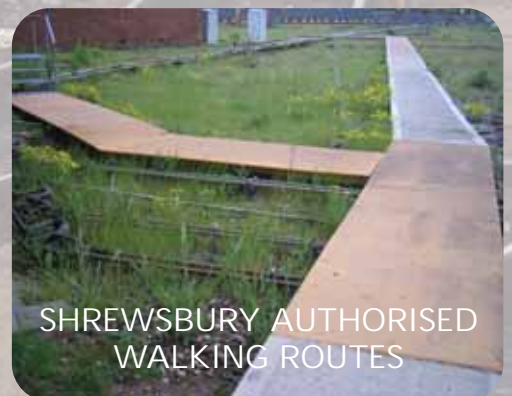
SHREWSBURY AUTHORISED WALKING ROUTES

Walkways – Installation of authorised walking routes and walkways in various products from Rocol boards to concrete, also construction of access points and steps for vehicles and personnel, to access the track.